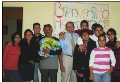
Special welcome from the Youth at Rio Verde